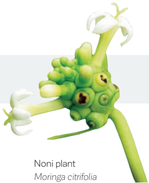
Noni plant Moringa citrifolia